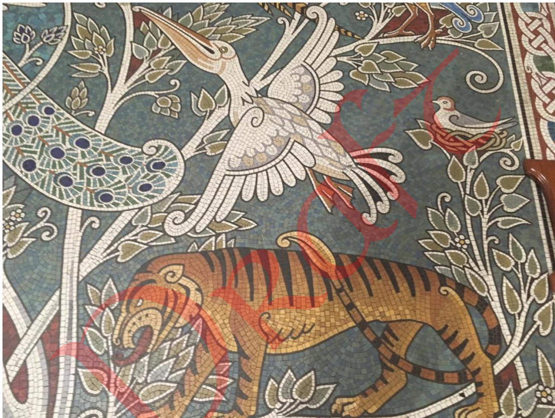
Honan Chapel Floor with Tiger used under a creative commons license.

Saturday: 9-10 am: Tutorial; 10-11 am: Liturgical Vocabulary; 11 am-1 pm: Liturgical Questions; 2-4 pm: Liturgical Journal.