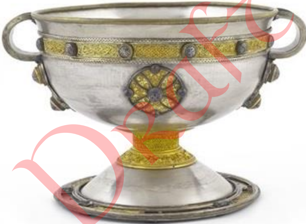
Ardagh Chalice in the National Museum of Ireland used under a creative commons license.